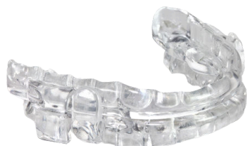
ProSomnus® EVO® Device

An oral appliance is worn over your teeth at night, like a retainer.